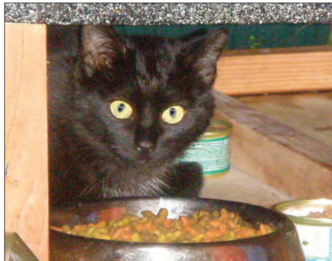
Dot eating from a feeding station made by a kind volunteer

Visit our website: Fairfranscommunitycats.org